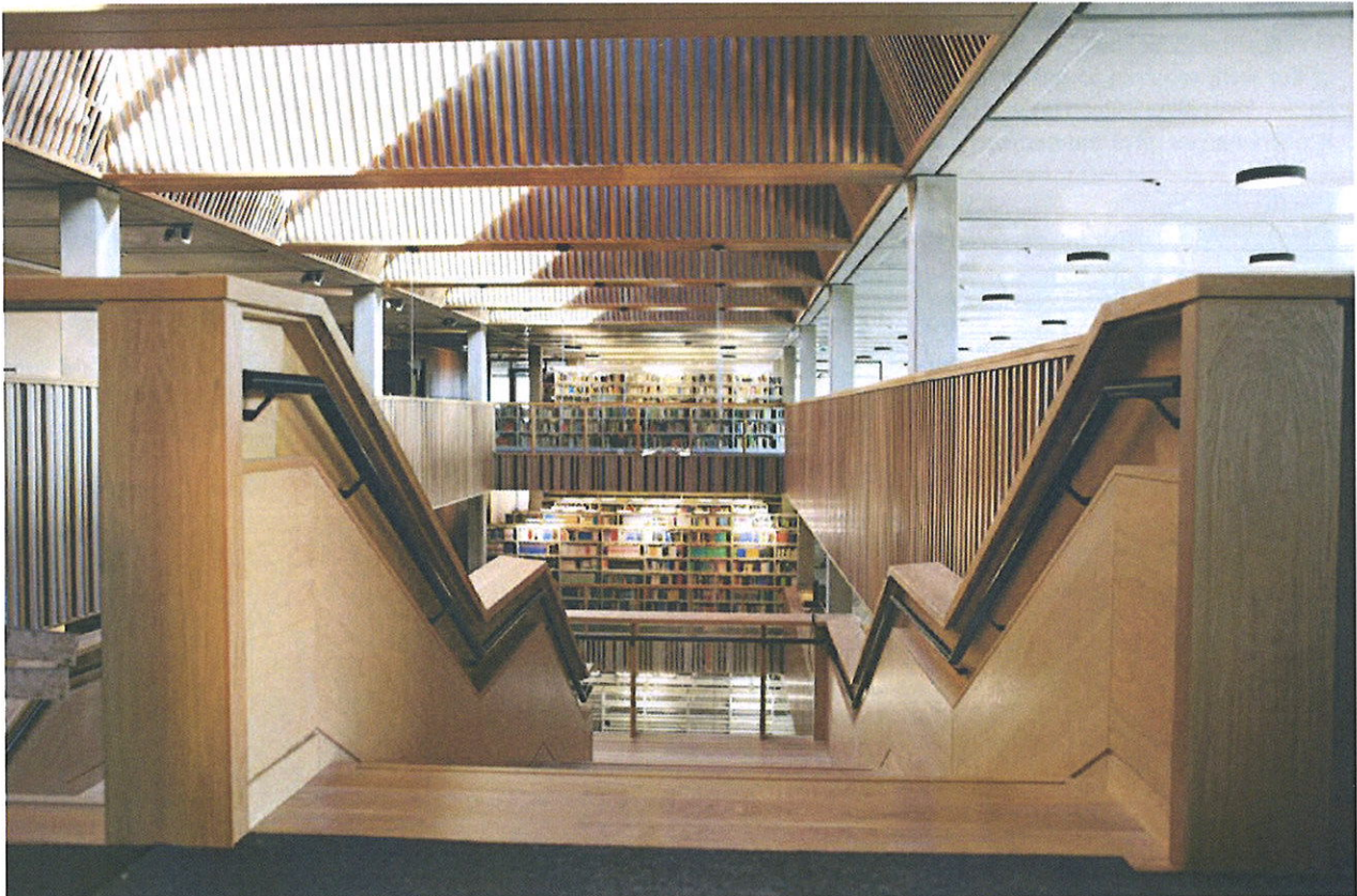
New University Library, September 2017

The building has been built to high energy standards, reflecting the University's commitment to environmental sustainability.